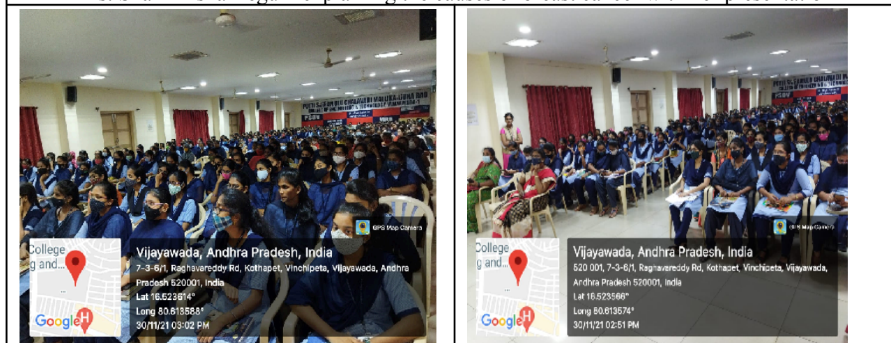
Audience at the presentation