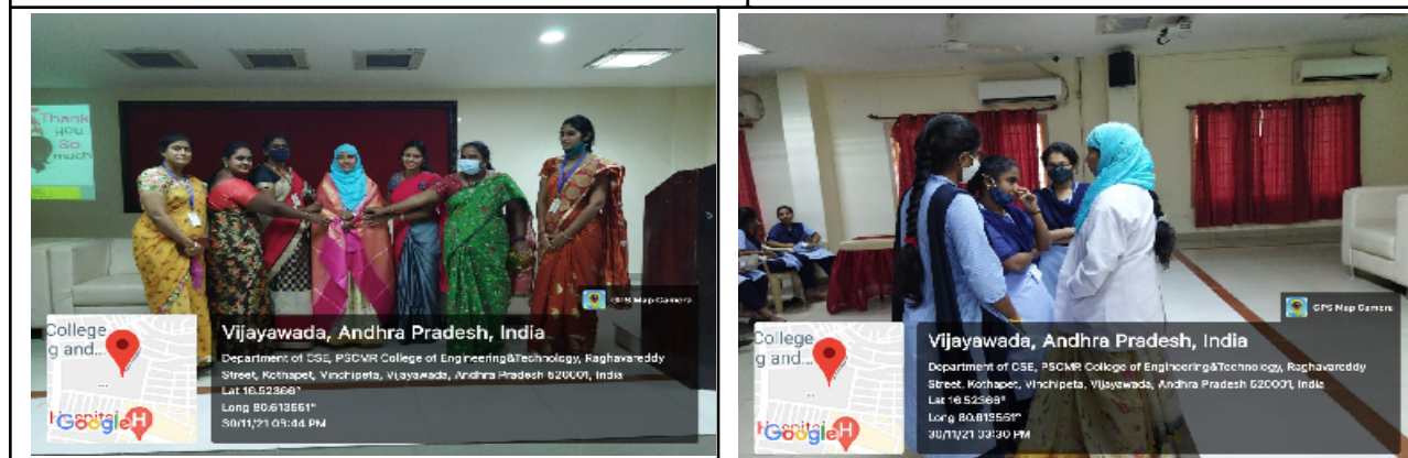
ICC Members felicitating the speaker