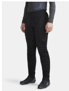
MENS CORE XC SKI TRAINING FZ PANTS