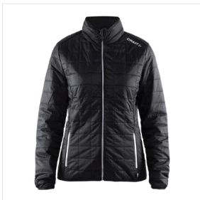
Women's Primaloft Stow - Light Jacket