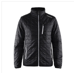
Men's Primaloft Stow - Light Jacket