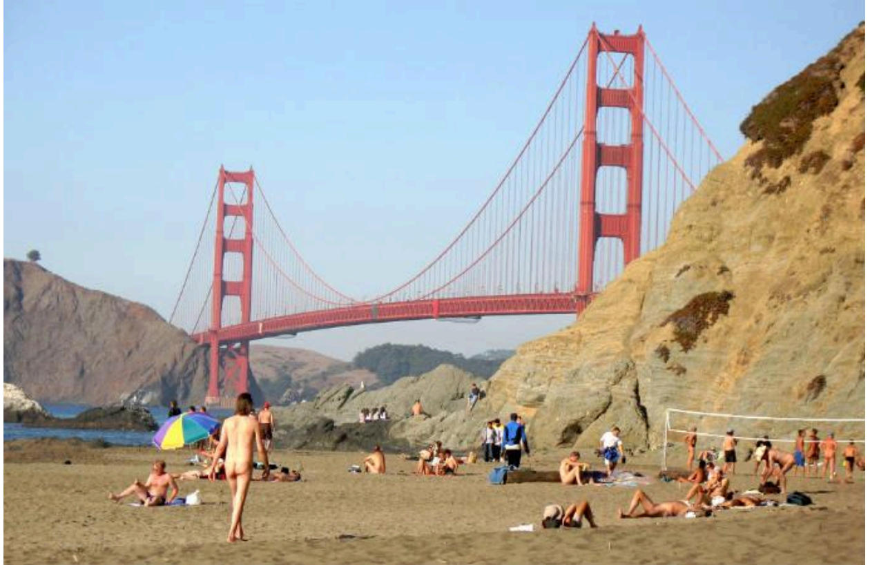
Golden gate nation park conservancy