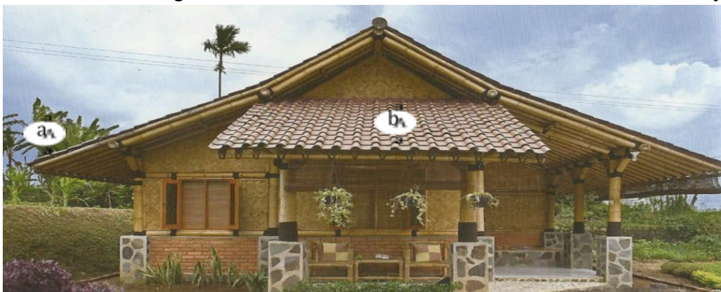
Figure 2. The appearance of Desa Banyuresmi: (a) Majority of house type owned by the community; (b) Grass appearance of the community field.

The research must contain at maximum 3 (three) figures and/or tables. If a group of photos or figures shows a process, the group is considered 1 (one) figure. Each group of figures have to be prefaced with a description which links the figures. Relevant documentation with a focus on community empowerment