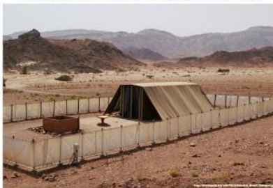
Model of Tabernacle in Israel

Aaron was the first high priest and his sons were made priests. The tribe of Levi also worked in the tabernacle with Aaron. There were special clothes made for the priest. (ch. 39) The priest wore a turban on his head, also called a mitre. (39:30) there was a gold plate on the front that said HOLINESS TO THE LORD and was tied on with a blue cord.