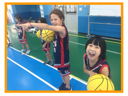
Grade 4 Basketball Boys and Girls, come out and PLAY!