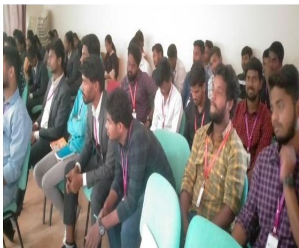
Student's involvement in the Activity

An Online quiz was conducted by NISM at the end of the programme on 02.03.2023 and Certificates were distributed to all qualifying students. NISM also issued Certificate of Participation to all participants who attended the workshop. Sixty (60) students from both seniors and juniors enrolled for the workshop.