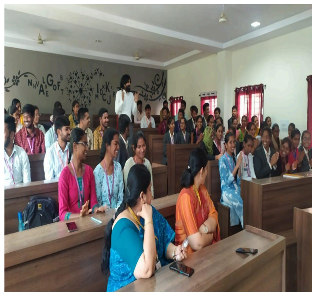
Students involvement in the Activity