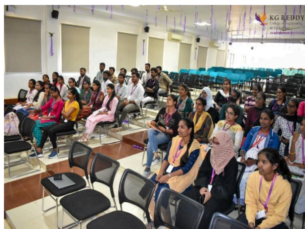
Students enthusiastically listening to the lecture.