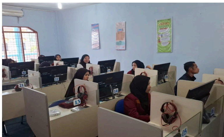
Figure 2. Title of the figure should be placed below the picture (10 pt)

If you are presenting your data in the form of bar graph, pie chart, frequency histogram, scatterplot, and other kinds of data-focused illustrations, the numbers and texts must be readable (in font size 10). Simple charts such as pie charts and bar charts should be editable (copied from Microsoft Excel; do not present them in the form of a screenshot) to allow for easy adjustments if need be. The figure should be bordered in a black line that spans the horizontal length of the paper. They must also be entirely original, unpublished artwork. Font type for the figure's text should be Calisto MT as well. Do not use wrap text for the figure!