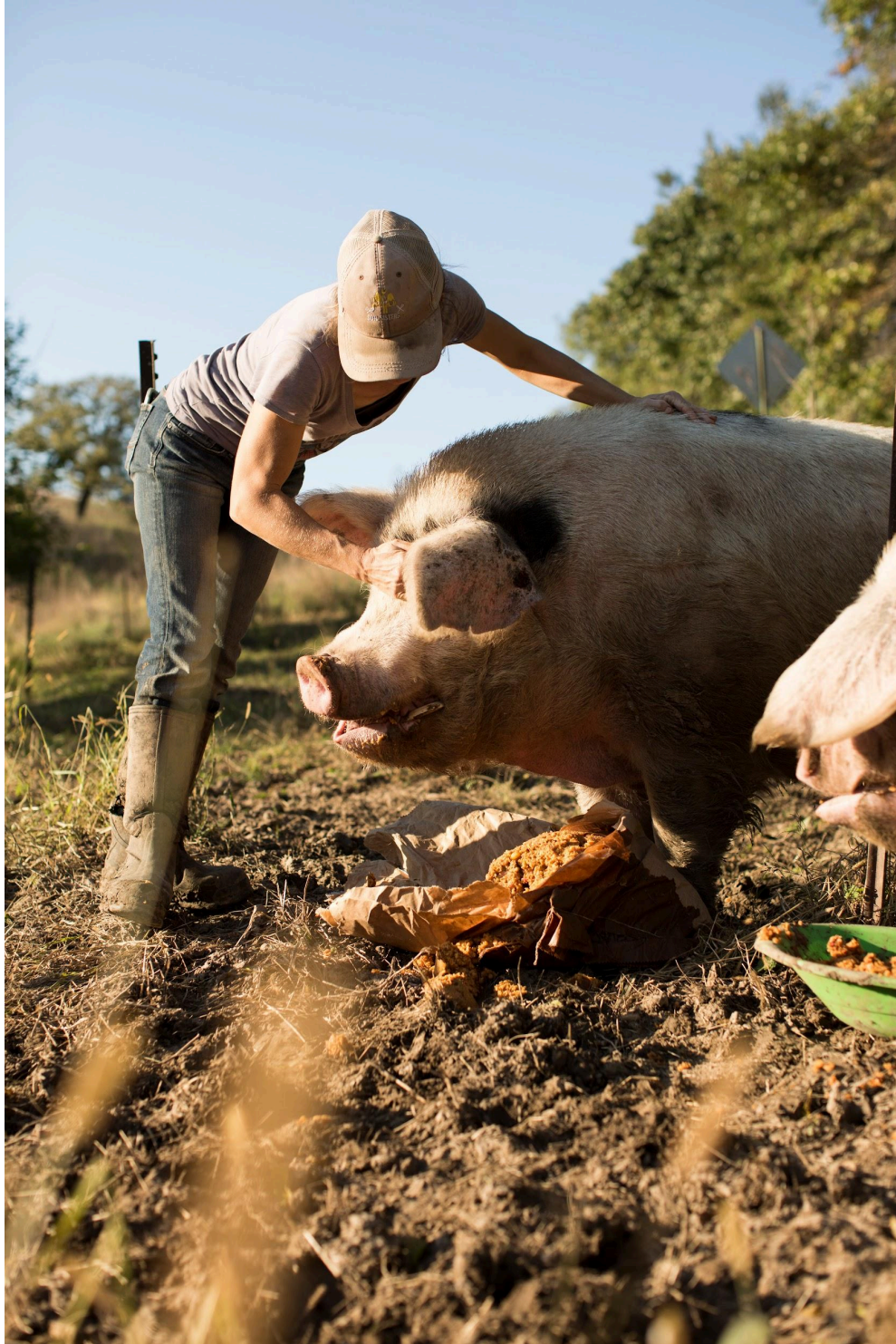
April Prussia of Dorthy's Range