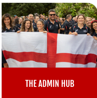
THE ADMIN HUB