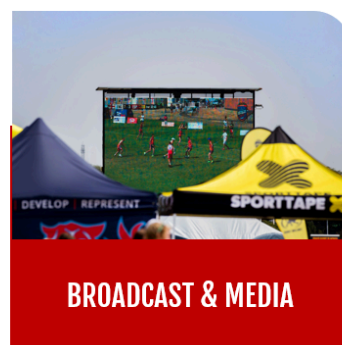
BROADCAST & MEDIA