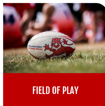
FIELD OF PLAY