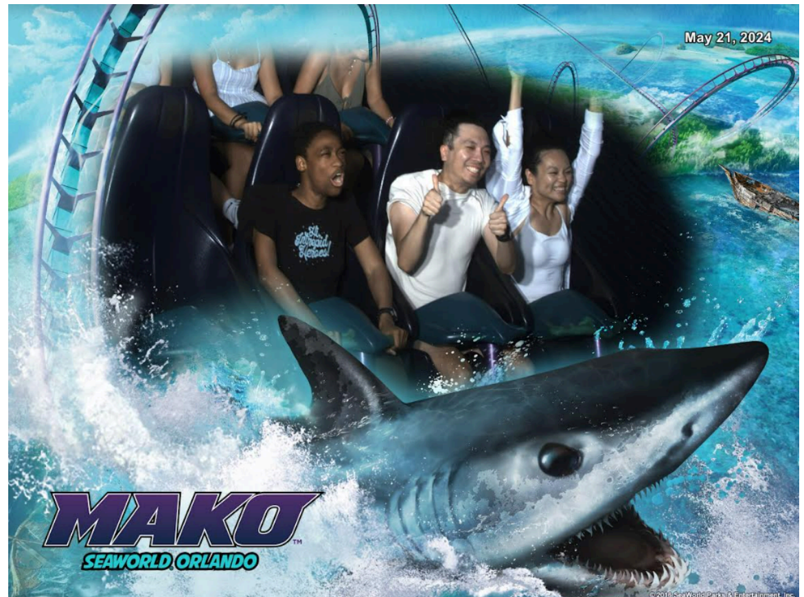
At SeaWorld with my roommate and her boyfriend