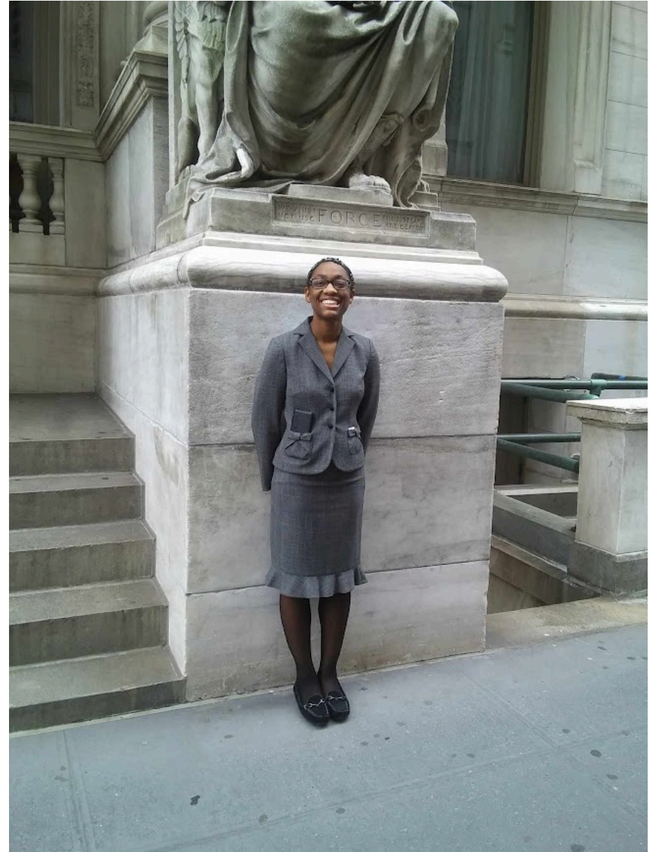
Just After my Swearing in Ceremony