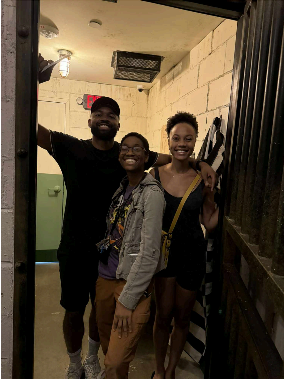
Escape Room in Atlanta with my Brother and his Wife