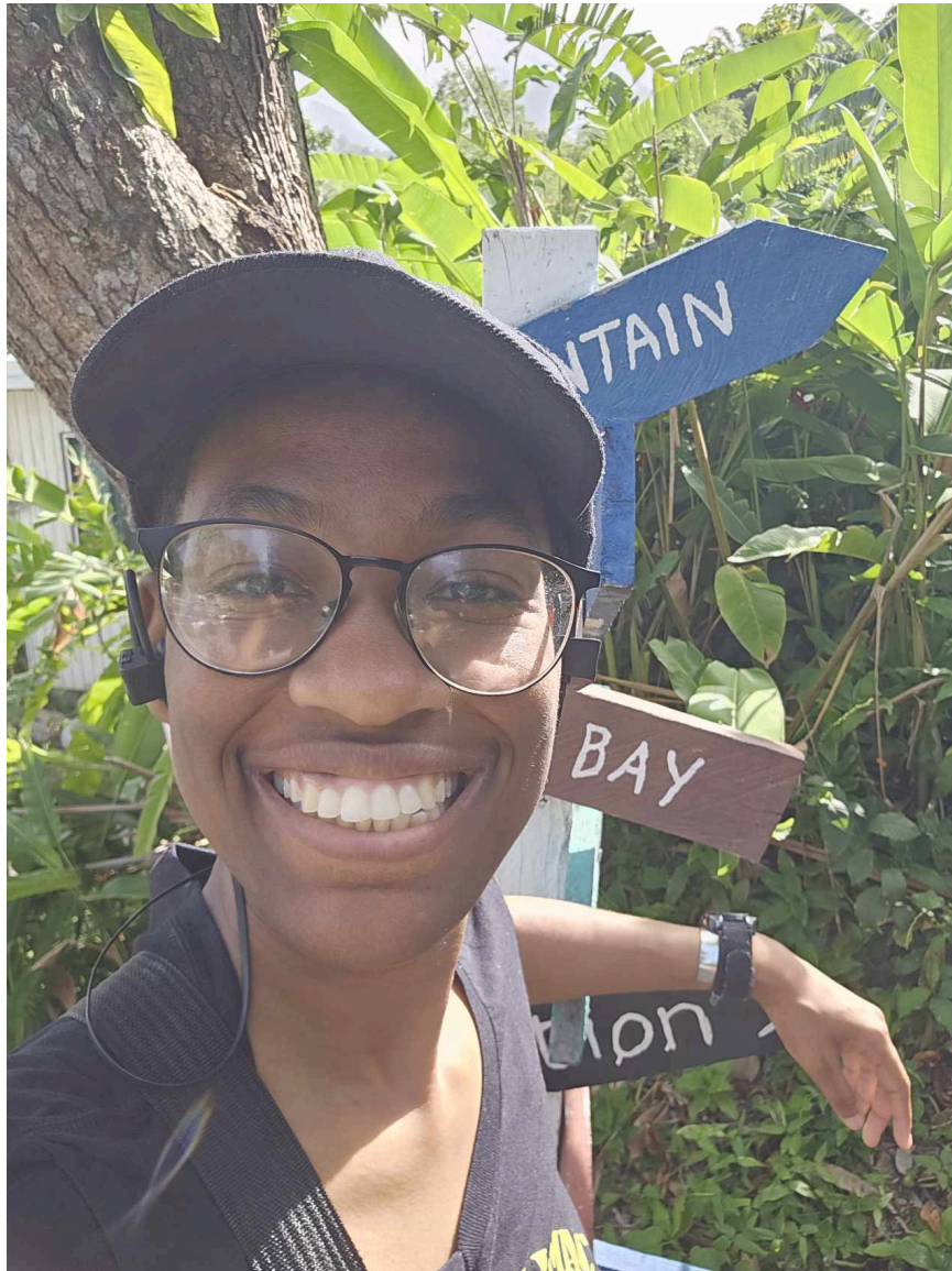
On Vacation in Jamaica