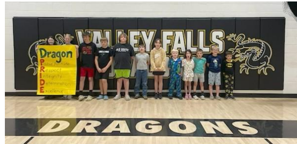
April 30, 2026