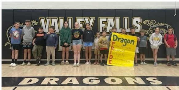
May 7, 2026