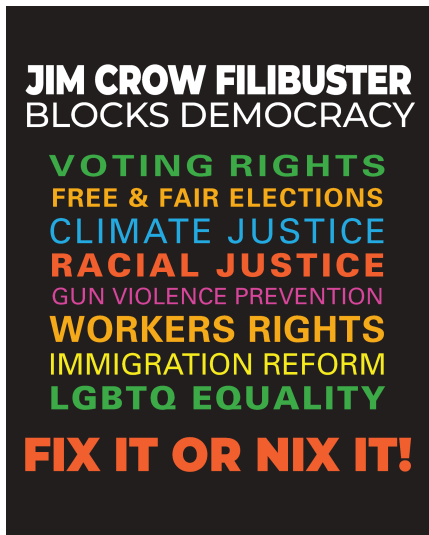
Facebook Graphic, Unbranded Download