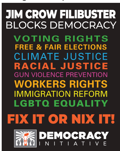
Instagram Graphic Download