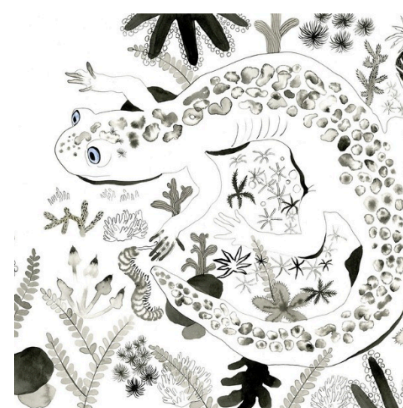
Artwork by unknown artist

Going for the gold? Really into this? Consider entering this student competition !