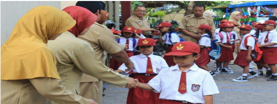
Figure 1. Inculcation of Student Discipline Character (9,5 pt, Normal)

Tables or Charts are a concise and effective way to present large amounts of data. Author should design them carefully so that author clearly communicate research results to busy researchers.