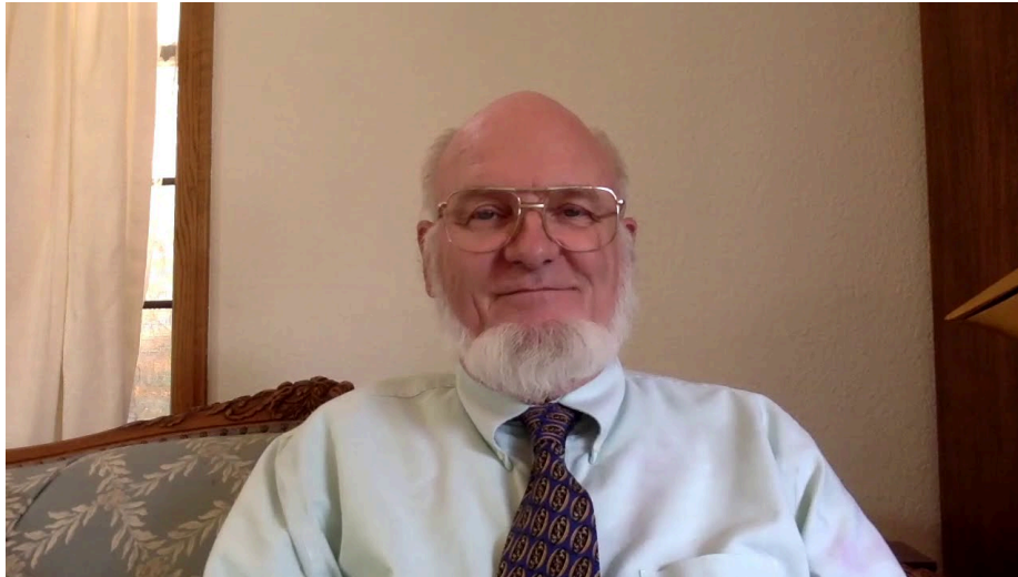
Tablekitten smiles as he debates Greylat

Tablekitten: IcyHelicopter, that's because it was settled after being occupied in the 1967 war.