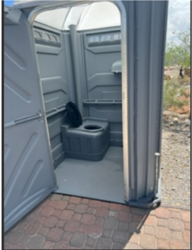
Example given by BLM, with grab bars for ADA www.documentcloud.org/documents/25475062-red-rock/