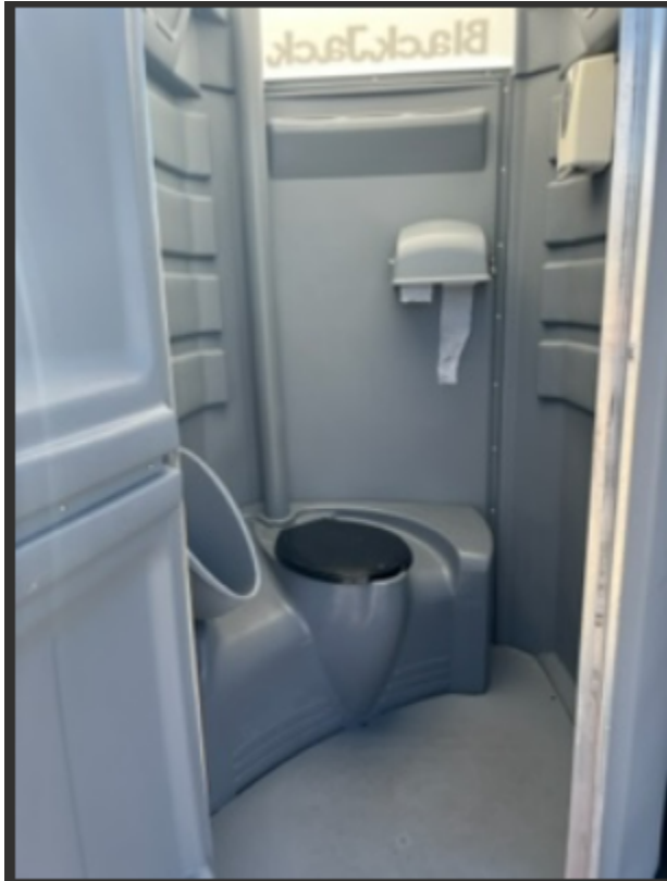
Example given by BLM, with split seat, urinal & waterless soap dispenser www.documentcloud.org/documents/25475062-red-rock/