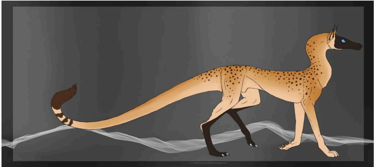
Red Pangare Cheetah