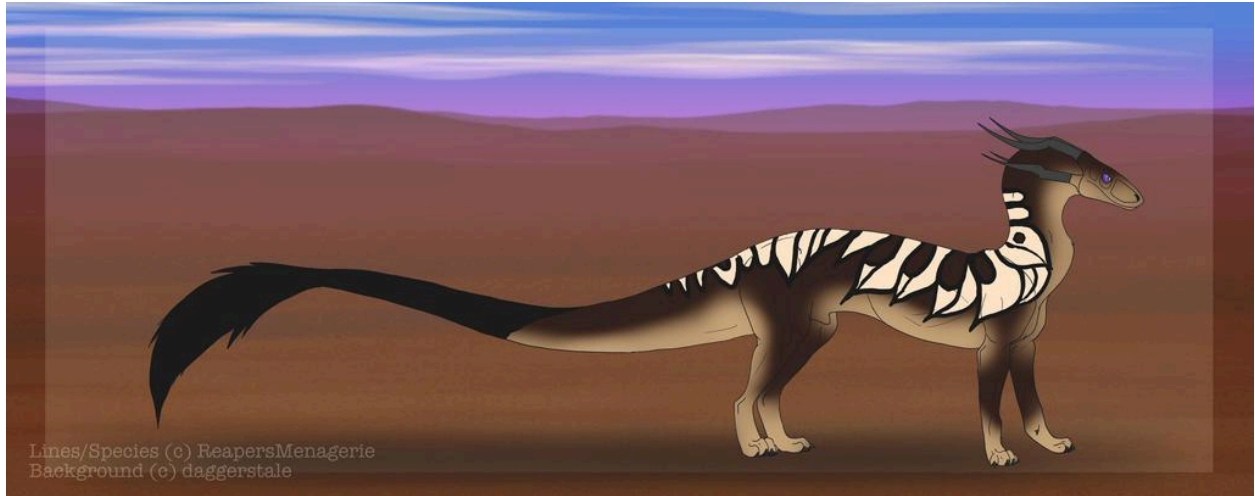
Chocolate Pangare Chocho dipped