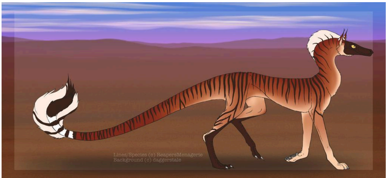
Flaxen Orange Pangare Tiger