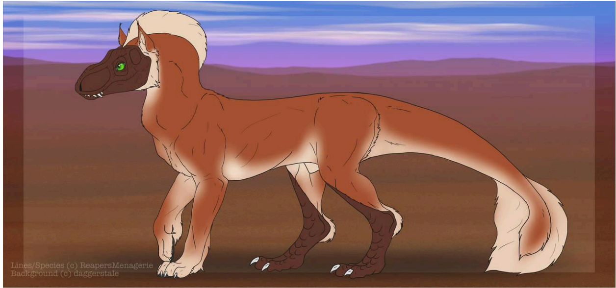
Flaxen Pangare Red