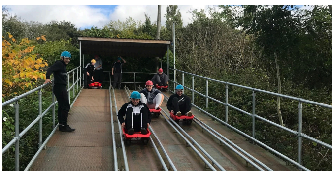
Speed was key in the Cresta Run

As part of their Cambridge National in Sport Studies qualification, the year 11 pupils visited Phasels Wood Activity Centre to complete climbing, abseiling, low ropes and orienteering. The pupils overcame their fears about heights, demonstrated fantastic team work and came away with some brilliant practical assessment results. The pupils will use the experience to complete their coursework about the benefits of outdoor adventurous activities in preparation for their final assessments.