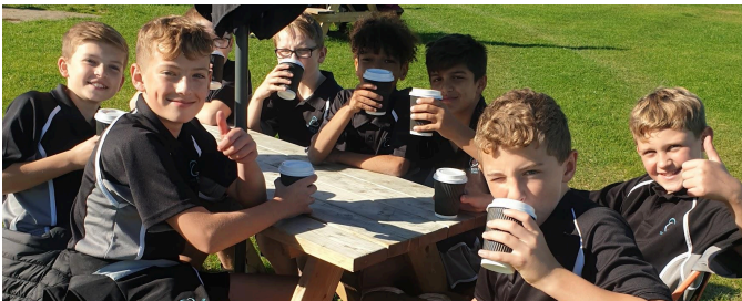
Year 7 enjoying a hot chocolate in the sunshine

All four year 7 forms pulled on their muddy shoes and ventured outside to explore the local area in their first Community Common Room project. Pupils enjoyed exploring the beautiful surroundings of the school as they weaved through the farmers' fields, ending the walk with a well deserved hot chocolate from the 'Tea Shack' our local independent coffee shop at Woodoaks Farm.