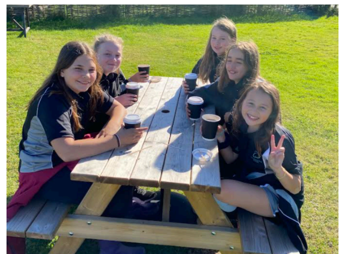
Yum! Yum! Yum!