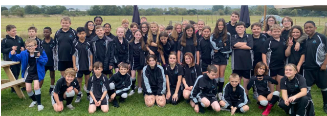
Say 'Hot Chocolate!'