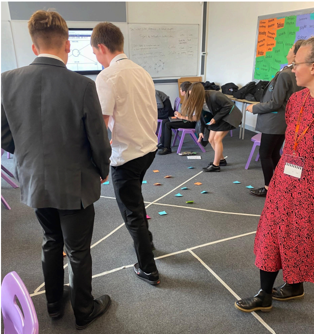
Year 10 working on their empathy map