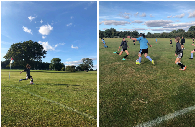
U15 girls in their win against Parmiters