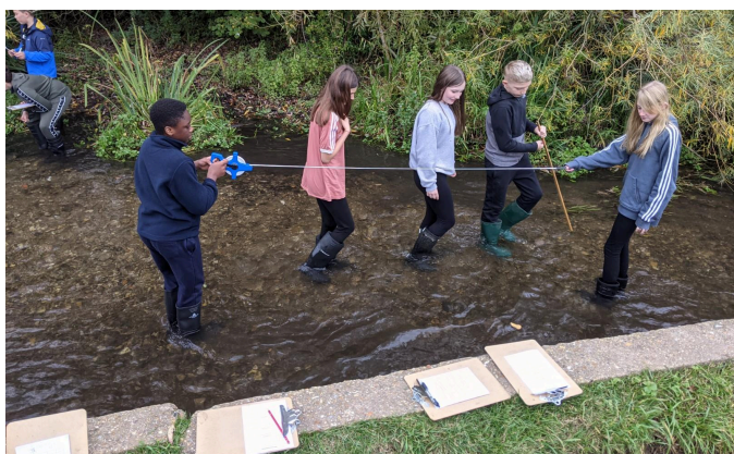
A group measuring the velocity with a dog biscuit