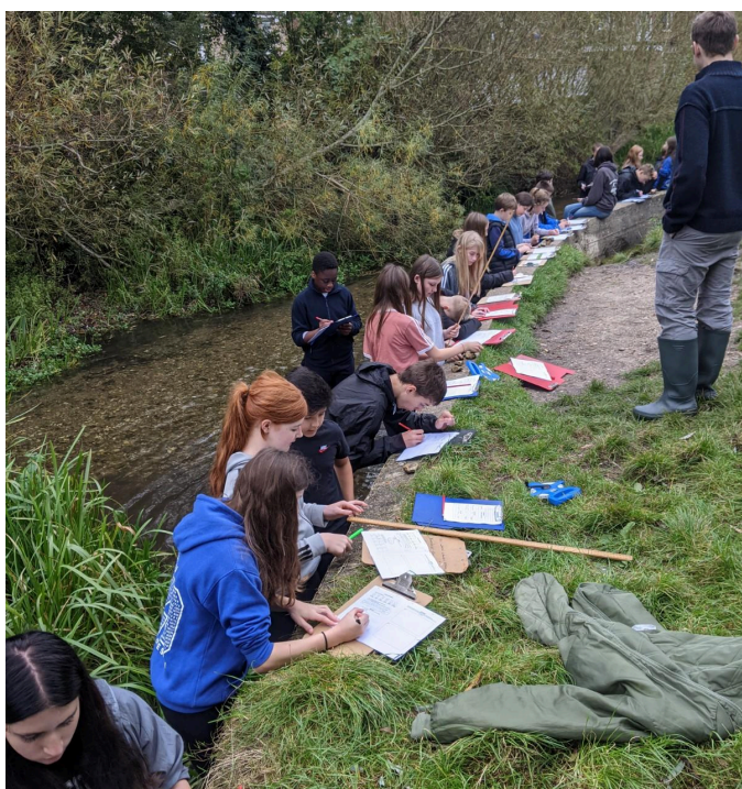
In the river gathering their results