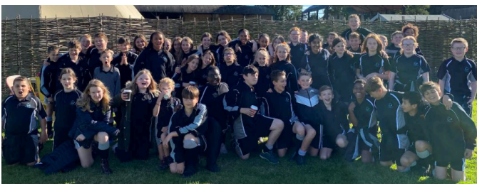
Community Walk cheer