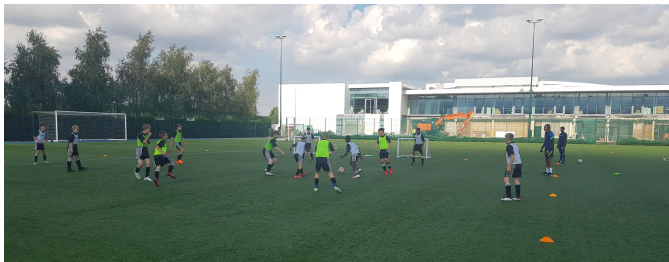
Being put through their paces during the session