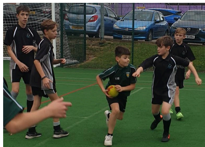
Year 7 and 8 Multisports