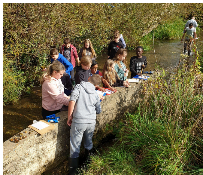
Writing up results