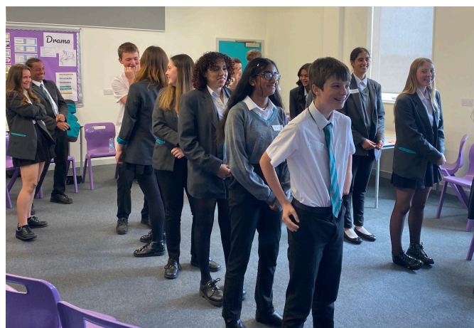
Year 10 communication exercise