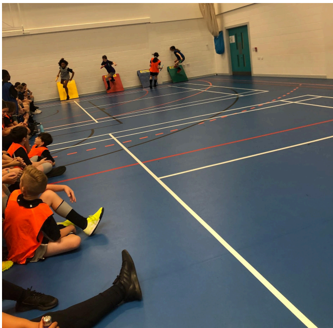
Year 8 Indoor Athletics