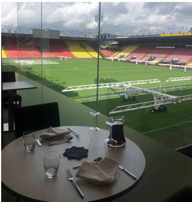
Danielle HP, Keah-Cadey M and Elaina H's fine dining set up overlooking the stadium with Elaina's specially folded napkins