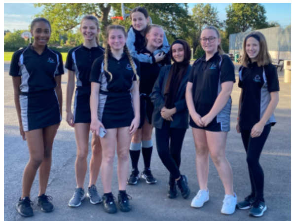
Year 9 pupils after their win against Futures Academy

We've had a successful start to the district netball season with wins over Futures Academy for Year 7, 8 and 9, plus draws against Bushey Meads and The Grange. We've had some narrow losses, and all teams are looking forward to their future matches in the season.