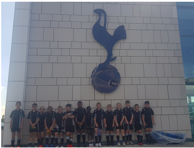
Year 8 pupils in front of the famous Spurs emblem