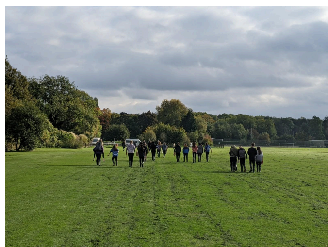
And that's a wrap - walking back to the mini bus after a successful trip