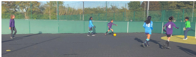
U15 girls enjoying themselves at Power League