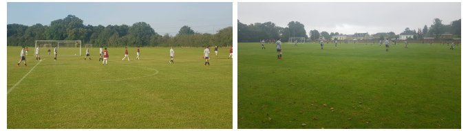
Year 8 boys featuring in victories at Parmiters (District League) and Leighton Park (National Cup)