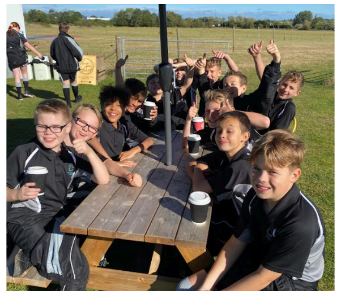
It's a thumbs up from them!