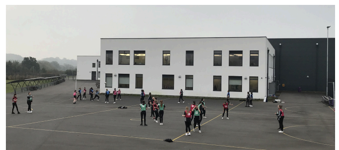
Year 10 Netball in full flow