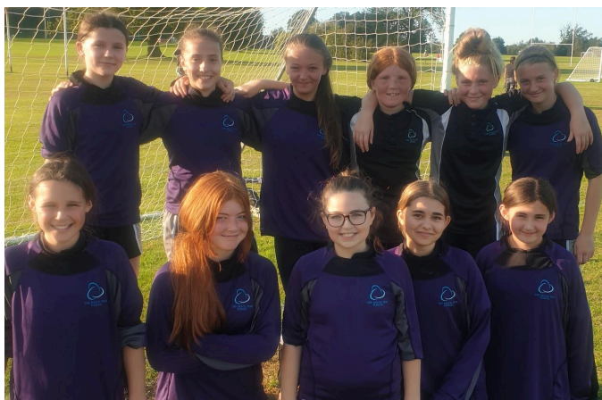
U13 girls after their first away fixture