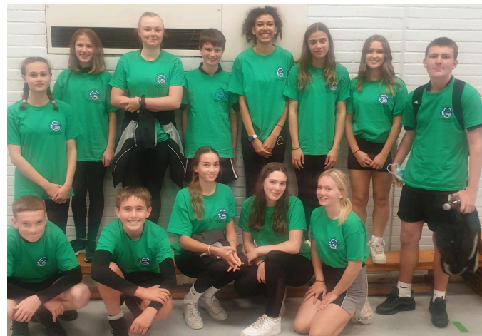
Y9&10 Leadership Academy Training Day