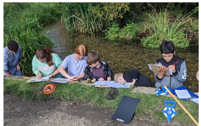
Writing up results and using the Power's index of Roundness to measure the pebbles

Our fourth annual year 8 trip to the River Chess was another roaring success with all four forms taking part in measuring key features of the river including the width, depth, velocity and pebble roundness. The weather was once again extremely kind to us and the shining sun helped to dry off some of the wet feet resulting from some enthusiastic wading!