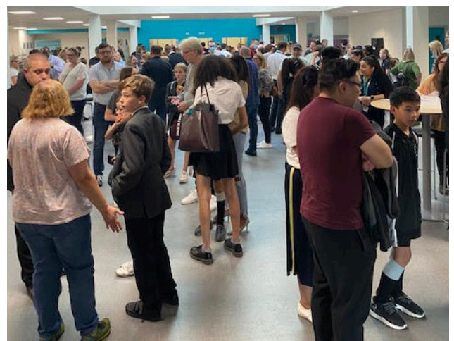
Parents, pupils and teachers at 'Meet the Teacher'

On Friday 24 th September it was wonderful to return to a face-to-face event and welcome the new year 7 pupils and parents to the school. This was a chance for our year 7 pupils to introduce their new subject teachers to their families in an informal way and for parents to finally see the school!