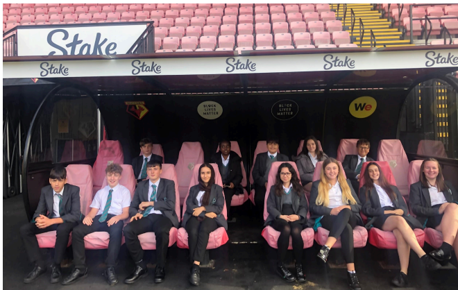
Year 9 in the dugout. New managers in the making?

The Premier League Inspires programme will continue to run weekly throughout the year which will include stadium events, group sessions, 1:1 support meetings and social action volunteering. It focuses on improving confidence, developing skills, gaining knowledge and creating a positive attitude.