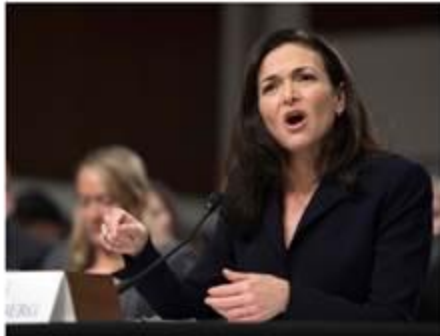
Facebook COO Sheryl Sandberg testifies before the Senate Intelligence Committee on Capitol Hill on Sept. 5, 2018.

To critics from Silicon Valley to Capitol Hill , that is likely to be seen as a continuation of the “ delay, deny and deflect ” strategy covered by The New York Times that got them into hot water in the first place.