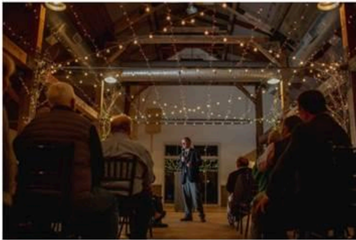
Vermont Gov. Phil Scott speaks at a campaign event at the Mountain Top Inn and Resort in Chittenden on Monday.