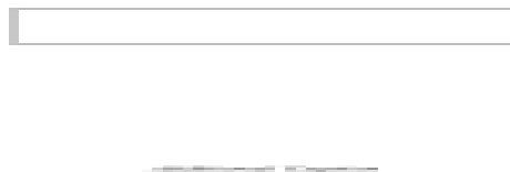
Figure 1: The author with unidentified friend, 2019.