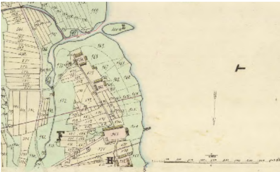
PHOTO 2. Letter F stands for the Frankkila house. There are seemingly big buildings and a dock on the riverbank. The Main road on the left. Karl Burman 1852, Lantmäteriet.