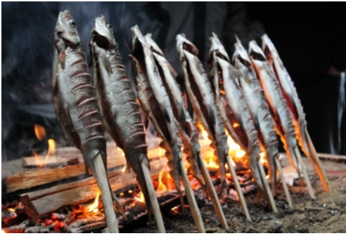
PHOTO 7. Whitefish in Kukkola is roasted on an open fire.