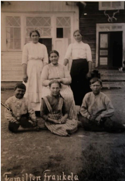
PHOTO 1. The Family on the yard of the historical guest house, Frankkila, in Kukkola.