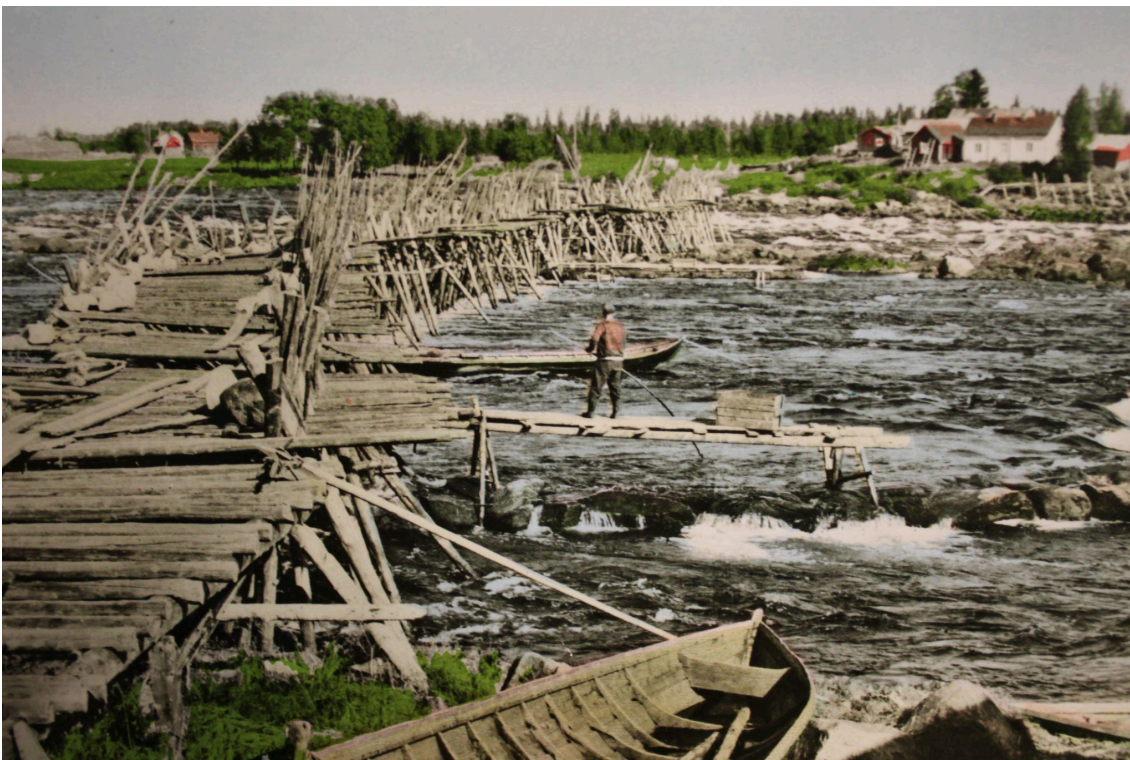
PHOTO 9. The Kukkola rapids.