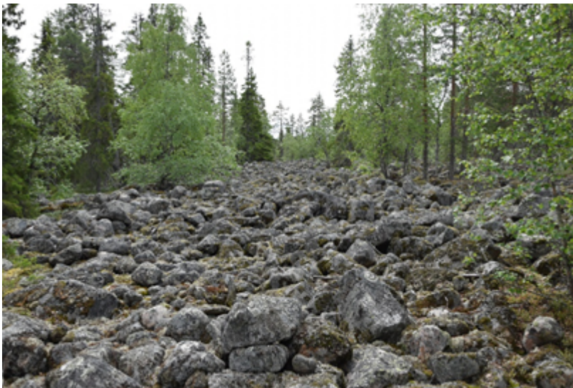
PHOTO 4. These rocky formations in Perävaara date back to the ice age and when ice started to melt down.