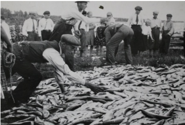
PHOTO 8. A Traditional whitefish sharing in Kukkola.