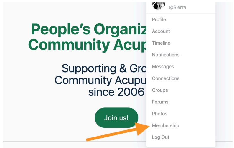
Step 2: Click “Membership”