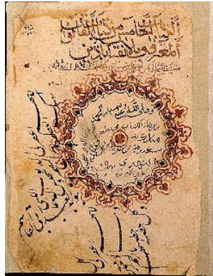
Ibn Sina's medical text from the 1000's AD

mother to make sure she is getting the correct nutrients. This is a practice we still follow currently. The Canon was reproduced as fifteen Latin editions during the 15 th century and translated into Hebrew, which had a major impact on Jewish medical practice. It was the basis of the curriculum used in medical schools throughout Europe to perform surgery and deliver babies safely in the case of complications.