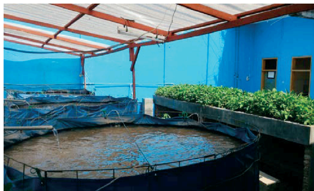
Figure 1. Catfish Pond Construction.

The online version of the journal contains images as sent by the author, while the printed journal is printed in black and white, the author should adapt the image to these conditions. Examples of image placement and naming are shown in Figure 1, Figure 2, and an example of displaying a diagram in Figure 3.