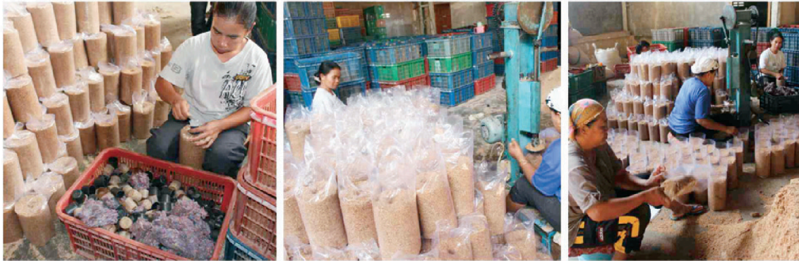
Figure 2. Field practice in the production of Slawi mushroom farmers' bag-logs.