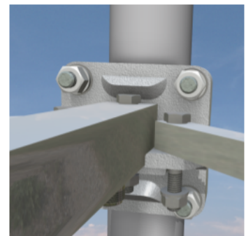
Fig. 2. During installation