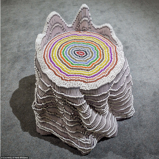
Herb Williams makes sculptures out of crayons!