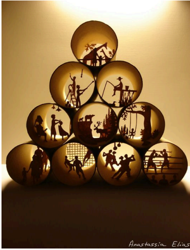
Anastasia Elias creates these little sculptures from toilet paper rolls!

Check out this list of artists who use unique art supplies or different approaches to making their art! Maybe you will be inspired to explore or invent your own approach to artmaking!