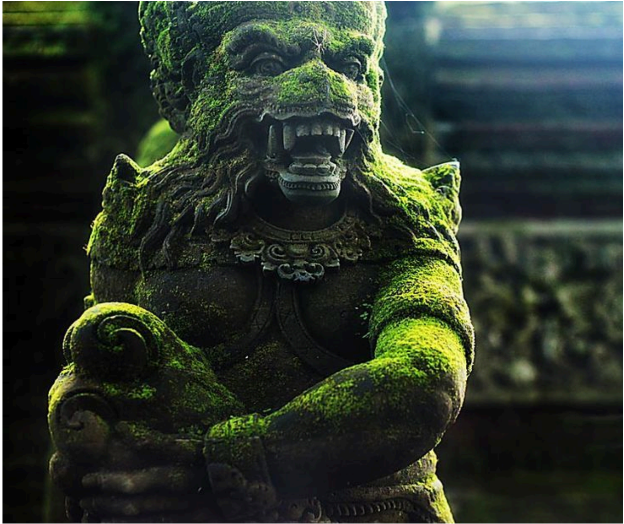
A statue of the Monkey King

Every night over 150 men from the village gather in concentric semi-circles arranged around a statue of the Monkey King.