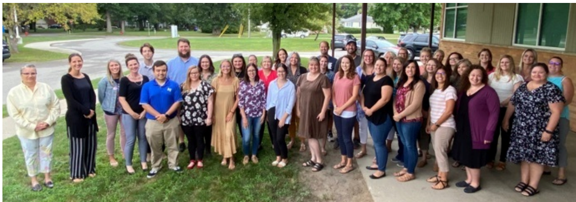
Some of our new teachers on a short break during New Teacher Orientation. Visit our District Facebook page to see more photos of this event.

Thank you so much to the following partners and sponsors for helping us welcome them to our community and our district. We appreciate your support!