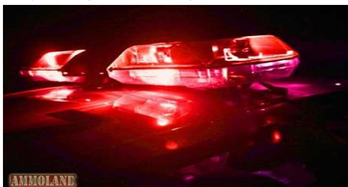
ATF Offers $5,000 Reward in Gun Store Burglary 17 Firearms Stolen From Qwik Cash Pawn

Investigators Seek Public's Help in Solving Crime, Recovering Stolen Guns.