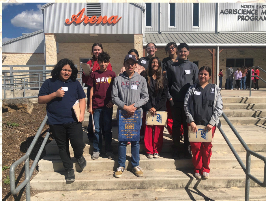
James Madison Invitational CDE's