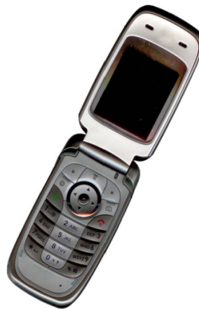
Fig 2. Example of an image with acceptable resolution

Figures must be numbered using Arabic numerals. Figure captions must be in 9 pt Regular font. Captions of a single line (e.g. Figure 2) must be centered whereas multi-line captions must be justified (e.g. Figure 1). Captions with figure numbers must be placed after their associated figures, as shown in Figure 1.