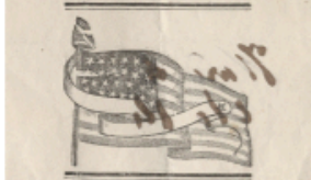
Democratic Electoral Ticket.

As a Democrat, you feel that you represent the common people of the United States: small farmers, laborers, and settlers moving west. You think that wealthy landowners and businessmen shouldn't have as much influence over politics—they're overrepresented as it is!