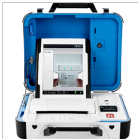
Hart Intercivic Verity Scanner