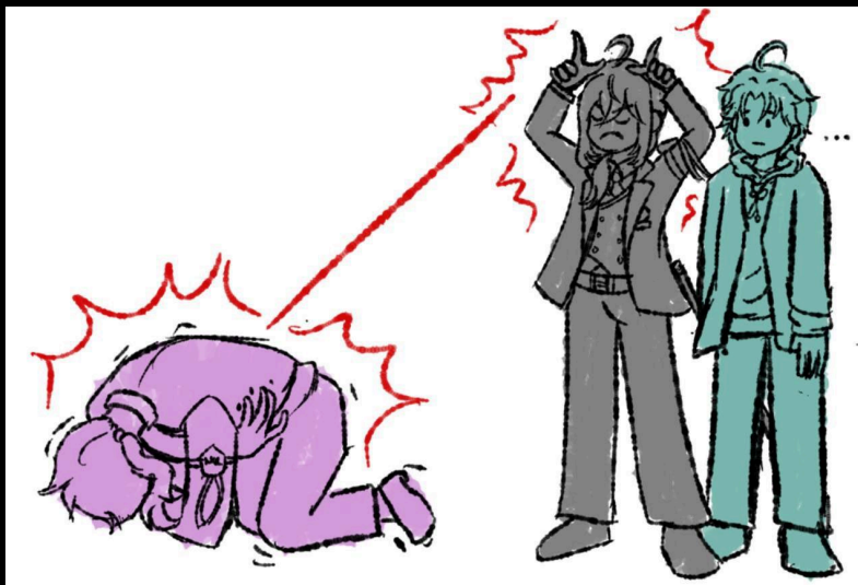
Period Cramp Transfer Beam