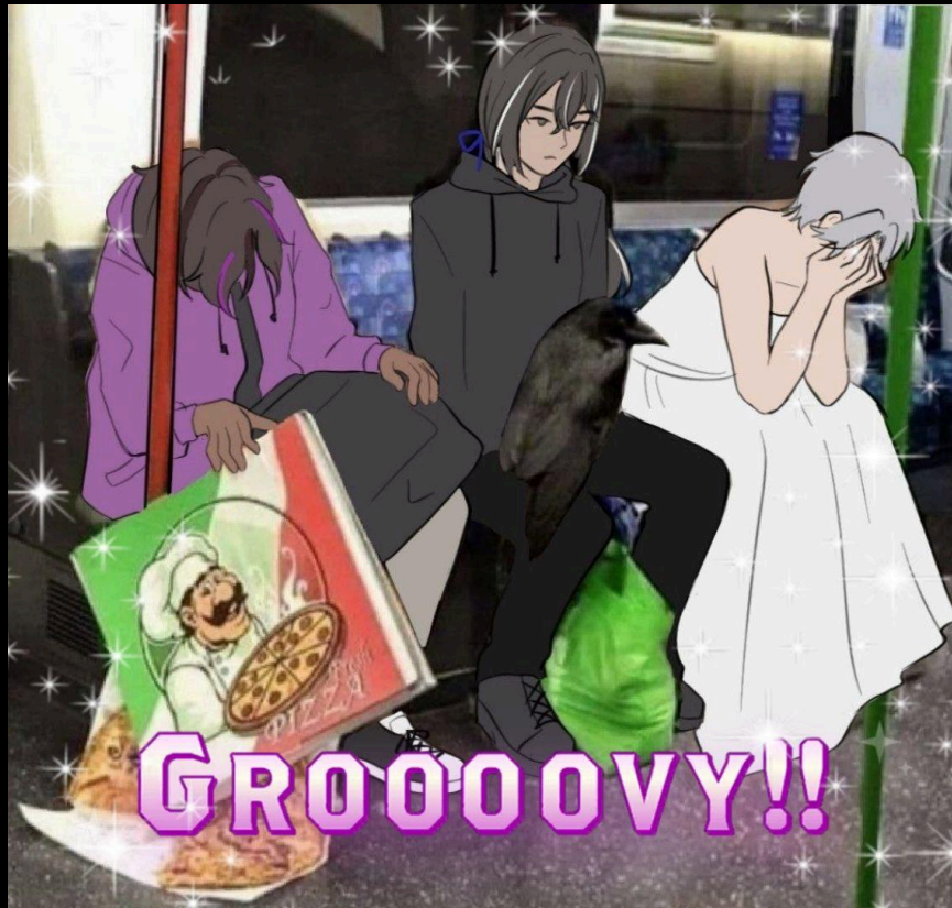
Kayle Fairy Gala SSR Groovy