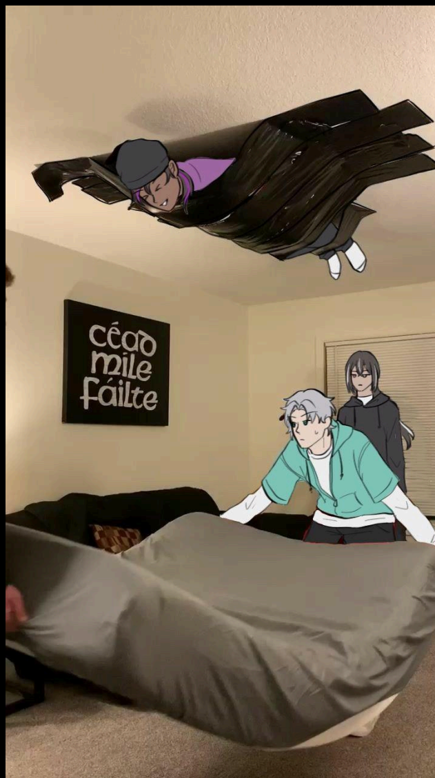
Average Halloween Shenanigans