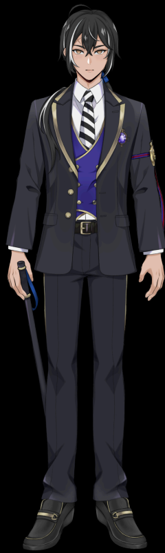
Suri School Uniform Full Body