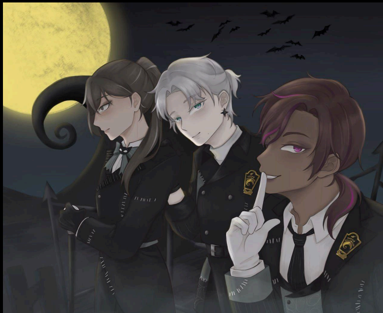
Halloween during Halloween