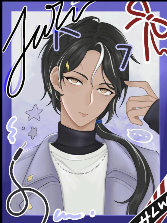
Limited Edition Pop Music Club Photocards