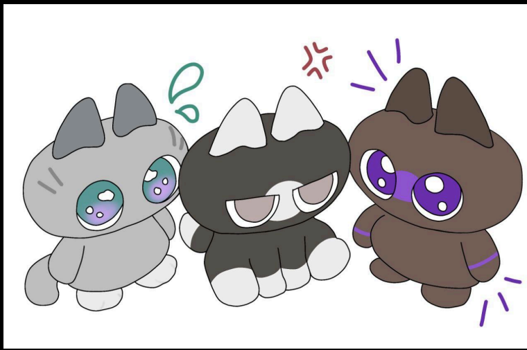
Halloween as Kitty Cats.