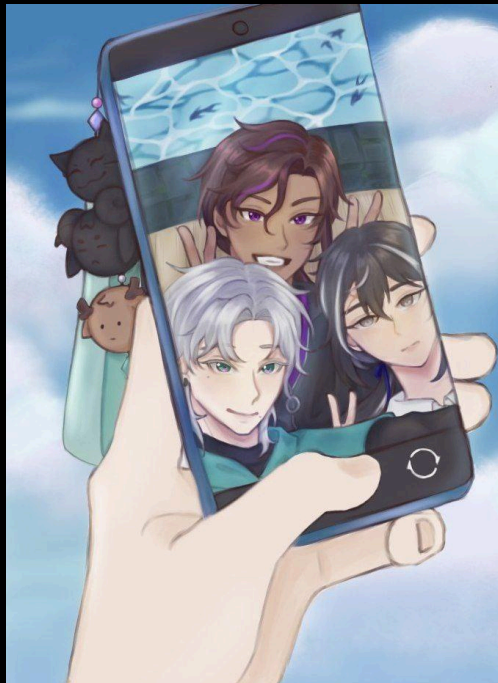
Best Friends 5Ever.