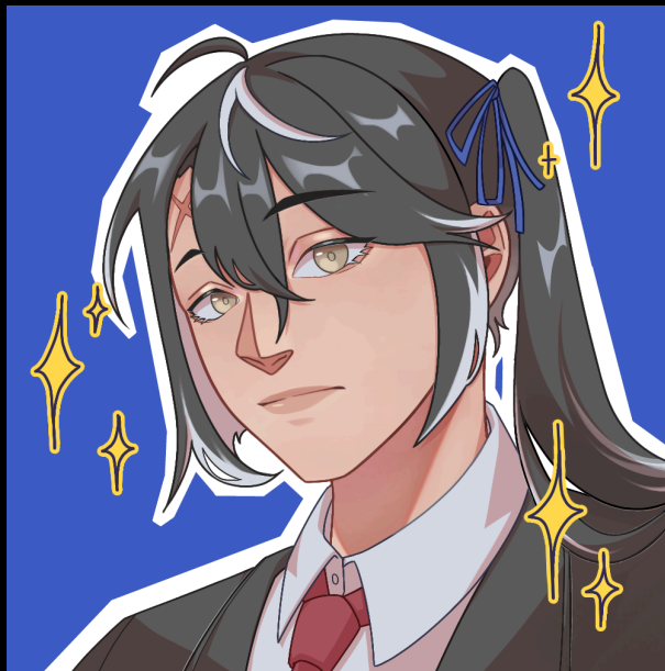
Art by: ct_lutharts @ ig