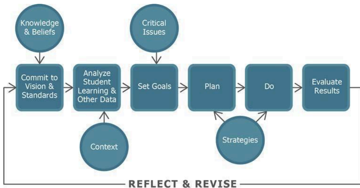
Figure 9.X. Professional Development Design Framework