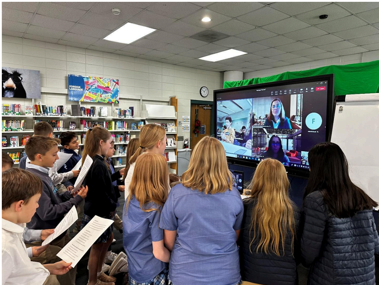
Students in the United States sang our school Alma Mater and Christmas songs. The students in Portugal sang a patriotic song, "Grândola, Vila Morena" by José Afonso.