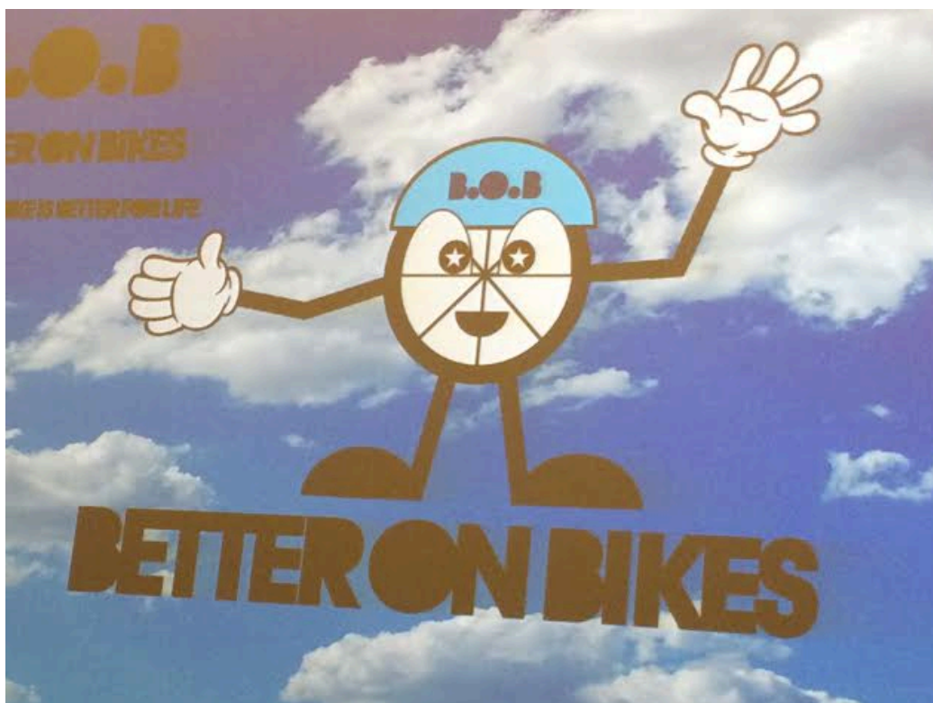
B.O.B, our logo

The photos below give a flavour of our day: