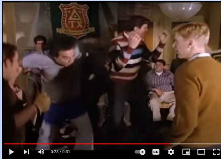
Animal House - Toga! Toga! Toga! Toga!