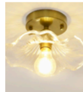
Master Closet Lights