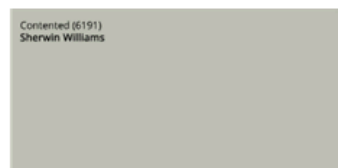
Master Closet Ceiling Color

Flooring - Existing Hardwoods (including master closet) | Wall Paint- SW Agreeable Gray (1 gl with 6 ounces white added) | Trim Color- match existing color | | Door knobs? | Pocket door Hardware? | Outlet Covers? | Dining Room Chandelier (Purchased/Paid by Lauren & at Dellwood!)| Foyer Light | Master Closet Lights (2) | Master Closet Ceiling - SW Contented Semi Gloss | Master Closet Walls - Match Sample of Bella Systems Smoke Green ( Lauren Has Color sample) | Master Closet Trim- SW Contented Semi Gloss | Master Bedroom Ceiling Fan | Kitchen Exterior Door- 32" Half Glass - Matt Sain ordered. | Door to Basement ? | Hall Closet Door ? | Exterior Light outside kitchen door.