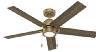
Master Bedroom Ceiling Fan