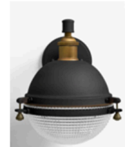
Exterior Light at Kitchen Door