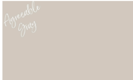
Paint in Kitchen, Dining, Master Bedroom and Closet, Hallway— 1 gallon with 6 ounces of added white or 5 gallon with 30 ounces of white