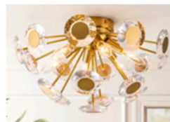
Foyer Ceiling Light