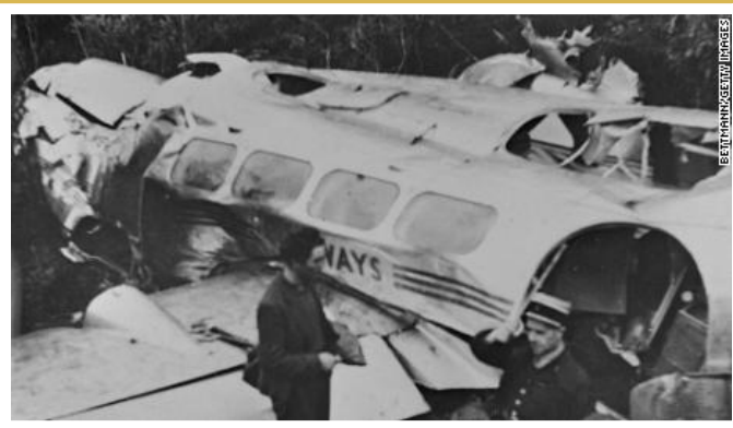
Alleged plane crash of "The Greek"