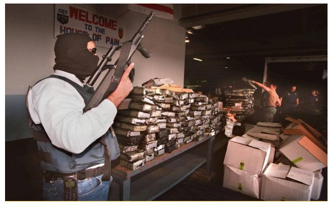
U.S Customs seizes Corsican Heroin