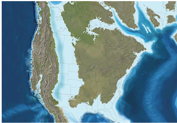
This map depicts the Great Interior Seaway over North America.