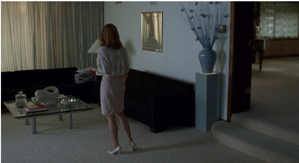
dir. Todd Haynes, SAFE , 1995