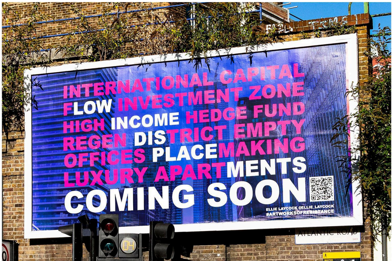
Ellie Laycock, Artworks of Resistance/Signs of Development , 2020