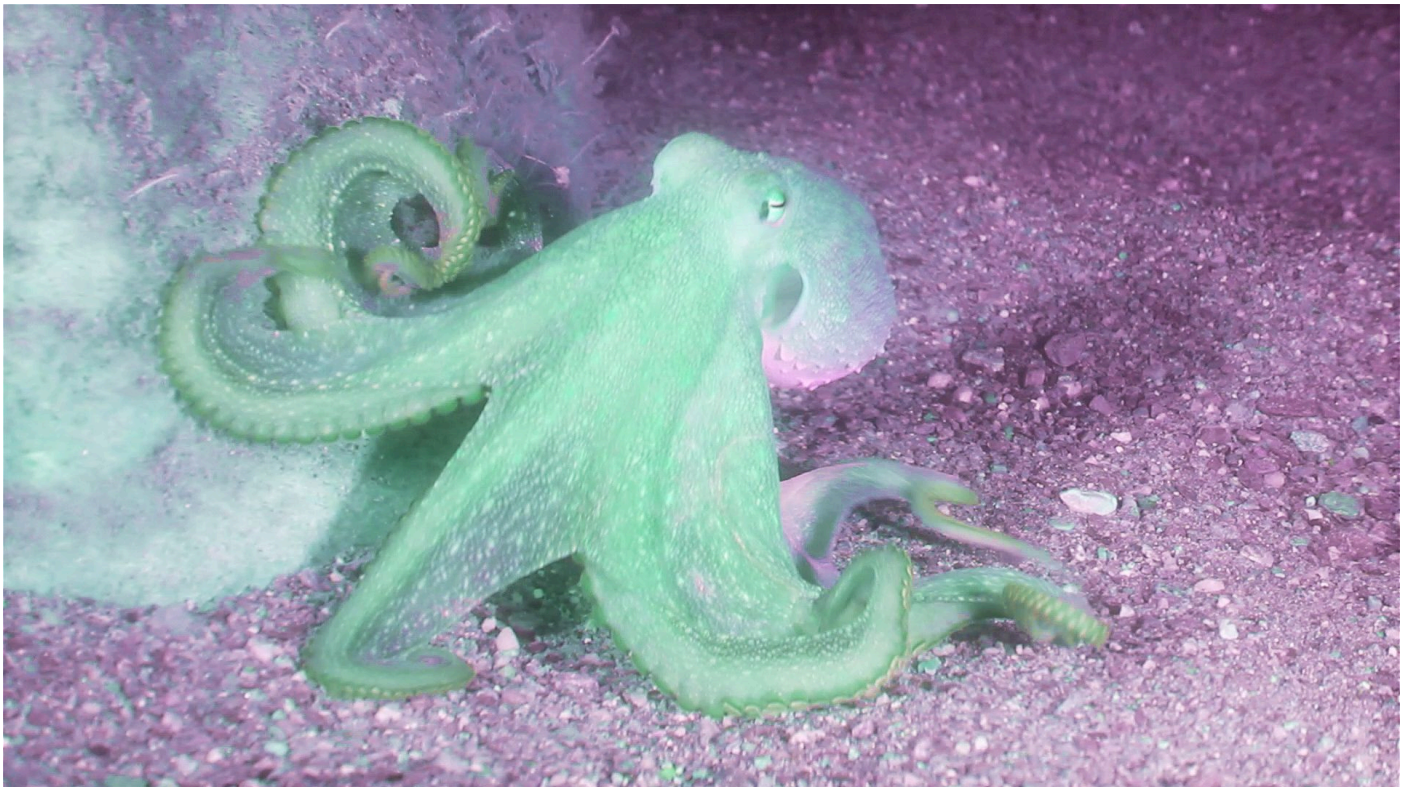
Monira Al Qadiri Divine Memory , 2019 still from video 5:00 min