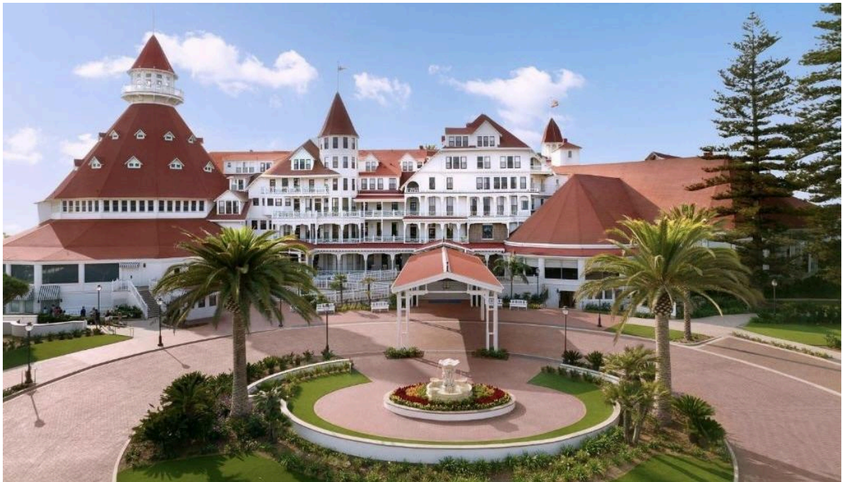
Alt: Hotel Del Coronado

Unearth the intriguing chronicle of one of America's most renowned establishments, the Hotel Del Coronado.