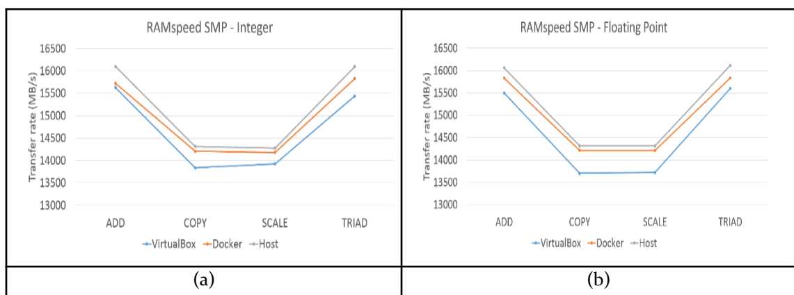
Figure 2. Memory performance results: (a)Integer; and (b)Floating point

Contents of the results of sub-subhead 1. Contents of the results of sub-subhead 1. Contents of the results of sub-subhead 1. Contents of the results of sub-subhead 1. Contents of the results of sub-subhead 1. Contents of the results of sub-subhead 1. Contents of the results of sub-subhead 1.