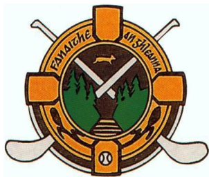
Fanaithe an Ghleanna

Fanaithe an Ghleanna Agus San Níoclás Roinn na n-Óg