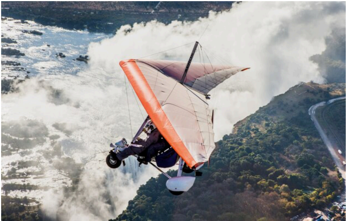
Alt: A man flies on a hang glider over the sea, view from the sea