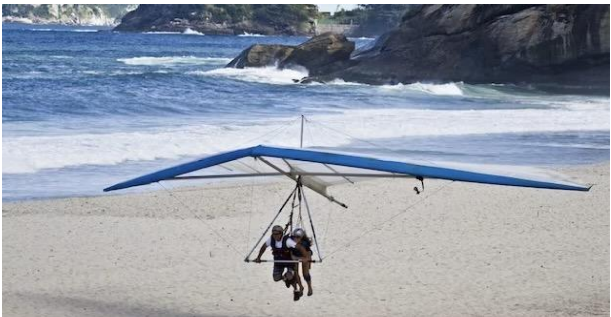
Alt: People fly on a hang glider over the seashore

California, with its diverse landscapes, offers the perfect playground for adventure enthusiasts. Among the exhilarating activities it has to offer, hang gliding stands out as a unique and unforgettable experience. In this comprehensive guide, we will take you on a journey through the world of hang gliding in California. From the best launch sites to safety measures and equipment, this article is your ticket to soaring high above the Golden State.