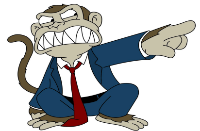
A dramatization of the monkey

Yesterday at 7:30 AM at Madison Square Gardens Train Station, there was a difficult case of hostages. The victims include a mother and two children, two businessmen, and a psychologist. The psychologist tried to cool the situation, but has only majored in human psychology. As for the monkey, he was heavily armed with a gun and was drunk out of his mind. It was said that he had gone through a tough divorce, with his wife taking the kids and the bananas. The situation was handled successfully, with the monkey being released under the tough circumstances.