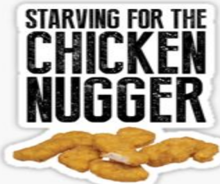
An inspirational campaign poster

With the upcoming rise of autocorrect and google translate, a worldwide food staple has become obsolete. The Chicken Nugger was a food valued tremendously by an outstanding amount of people, but has been disappearing from menus worldwide replaced by the lesser chicken nugget. Without the most valued food in the alphabet, people have been going on hunger strikes. They claim that if they go prolonged amounts of time without eating any food, the Chicken Nugger will return. This has caused the death of thousands, and the Chicken Nugger is estimated to be renegotiated further for future restaurants. Our journalists are standing by, hoping for a meal of Chicken Nugger and French Fried as soon as possible.