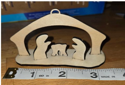
3D Ornament Discount $6